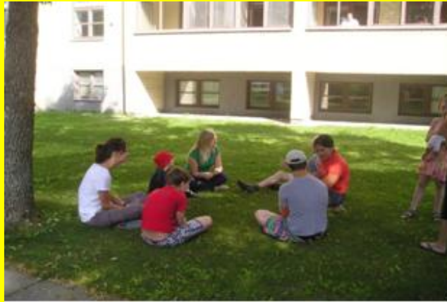
USD Graduate Students at Vilijampole